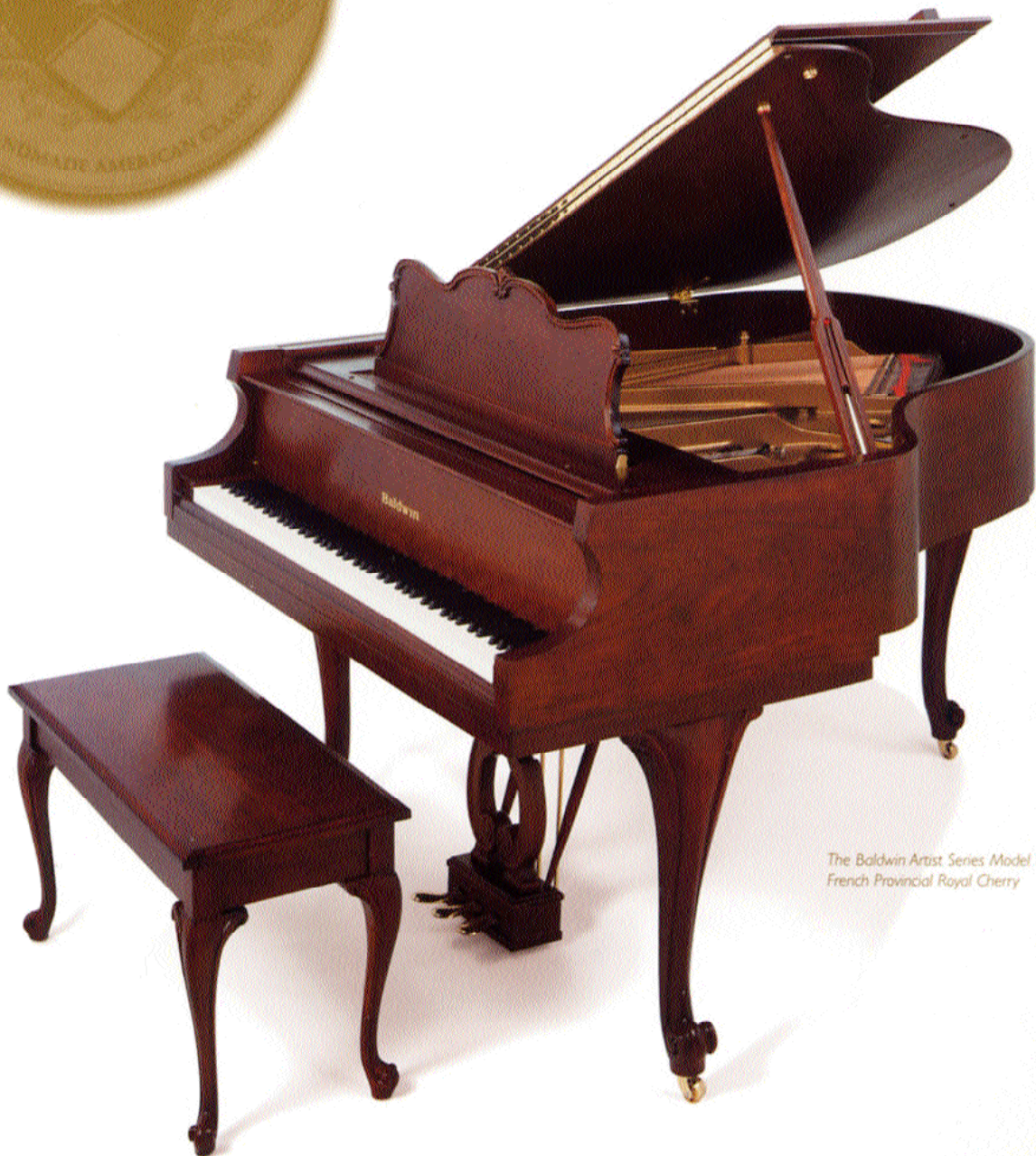
The Baldwin Artist Series Model 225E. French Provincial Royal Cherry

225E The Baldwin 225E, a 5'2" Artist Grand, features exceptional durability and note-to-note consistency. It combines the performance qualities of the Baldwin M1 Grand with a beautiful French Provincial furniture style.